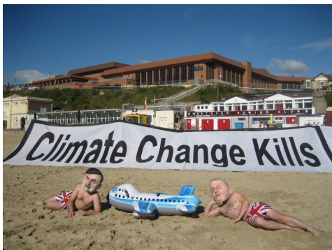
Climate change was the big concern for many of the national organisations in AirportWatch.

For many of the national environmental organisations within AirportWatch, climate change was the big concern. It was the reason they started campaigning on aviation. They saw fighting airport expansion as part of their wider campaign against the threat of climate change. Organisations such as Greenpeace and Friends of the Earth put a huge amount of resources into their climate change campaigning.