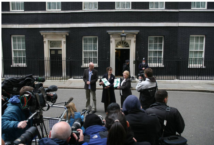
Facing the nation's media