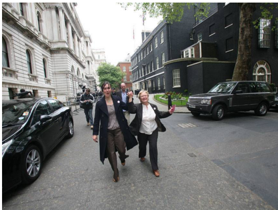
And skipping with sheer joy down Britain's most famous street. We've done it!