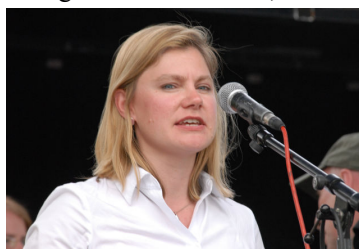
The tenacious Justine Greening, the Conservative MP for Putney, played an important role in the campaign from the early days.

The Liberal Democrats and, not surprisingly, the Green Party had come out firmly against expansion at Heathrow. But, perhaps most interestingly of all, it was becoming clear that there could be some real movement in Conservative Party thinking. David Cameron, the new conservative leader had set up a Quality of Life Commission to look at a range of matters. The members of the Commission were not just drawn from the Conservative Party. They included a number of campaigners from AirportWatch as well as leading lights from the aviation industry. The transport section was chaired by the former transport minister Stephen Norris whom I had known in the 1990s and liked. He had done much to push sustainable transport policies within the Conservative Party. At the Quality of Life meetings it became clear that he saw the sort of airport expansion the Government was envisaging as deeply unsustainable, particularly in the light of its growing impact on climate change. He was opposed to a new runway at Heathrow. The final report of the Quality of Life Commission, though not taken on board as party policy, revealed that new thinking on aviation might well be emerging within the Conservative Party.