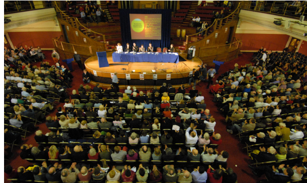
3,000 people poured into Central London for the biggest indoor rally in our history.

We had one big challenge left during the consultation period. We had booked the largest hall in Central Halls, Westminster, a well-known meeting venue in Central London, for an-end-of-consultation rally. We took an enormous risk. The hall held 2,500 people. We knew we had to fill it to make an impact. 1,000 people, normally regarded as a huge crowd for a meeting, would have looked like failure. As we had gone round our public meetings, we urged people to come and demonstrate their opposition to expansion in the famous venue, just across the road from Parliament and a stone's throw from the Department for Transport headquarters. That Monday evening, two and a half thousand people poured into the hall, with another five hundred in an overspill hall. As the band struck up, I looked across to NoTRAG's Geraldine Nicholson, who had done so much to help organise it, and we both knew we had done it. The rally, chaired by our President Jenny Tonge, a champion of the cause for many long years, was addressed by local and national campaigners, environmental experts and a vast array of politicians including Nick Clegg, the leader of the Liberal Democrats. Although the rally was free, when we asked for donations, we raised a total of nearly £10,000, which paid for the cost of hiring the hall. An inspiring evening.