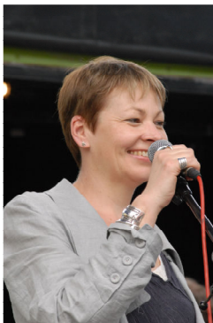
Green Party Leader Caroline Lucas, consistently helpful, spoke at a number of our meetings and rallies.

The coalition organised over 40 public meetings attended by an estimated 20,000 people in total