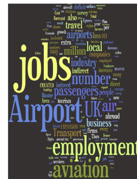
Some reports from AirportWatch have been translated into both French and Dutch.

We were making some headway. We had a memorable, accurate figure; one that challenged the prevailing thinking of the time. We