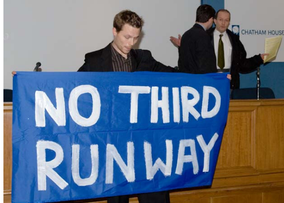
West London residents join Plane Stupid in disrupting aviation conference in Central London.

Plane Stupid became active in the Heathrow campaign. Activists, working alongside Seeds for Change, the organisation which assists community groups, helped train West London residents in direct action. These were local people, including a fair number of HACAN members, who had expressed an interest in taking direct action. The training led to a number of actions, including residents invading a major aviation conference in Central London where the Douglas Alexander, Secretary of State for Transport, was speaking. The purpose of these direct action events was two-fold. It was to put a warning shot across the bows of government that residents were willing to go further than ever before to stop expansion. But it also provided an opportunity to identify and train up people who might be prepared to take part in a prolonged campaign of direct action should the expansion proposals not be dropped.