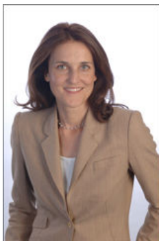
New Aviation Minister Theresa Villiers is ushering in a new approach at the DfT