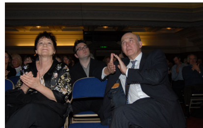
Sarah Ludford and Vincent Cable