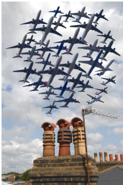
A feature of the last 15 years has been the way in which aircraft noise has become a problem many miles from Heathrow.

I began to chair HACAN, the Heathrow residents' organisation, in 2000. I had first become involved in aviation campaigning two or three years earlier. What prompted me was the sudden problem of aircraft noise over my house. I had lived and worked in South London for twenty years. Aircraft noise had never been a problem. I had always seen it as something of concern in West London and Windsor. That all changed in the second half of the 1990s. Aircraft started roaring overhead, sometimes at a rate of one every 90 seconds. I was not alone. Disparate individuals came together. We held public meetings, one attended by the local MP Kate Hoey, who has been a firm supporter of the campaign ever since. We formed an organisation called ClearSkies. The Department for Transport, with an evasiveness we were to come to know so well, said that nothing had changed and that, anyway, we were far too far from Heathrow for noise to be a problem. (We subsequently learnt significant changes had been made). More than a dozen years later, aircraft noise is still a problem in South London. We may have stopped a third runway but the daily turmoil for people who never expected to be under a flight path goes on.