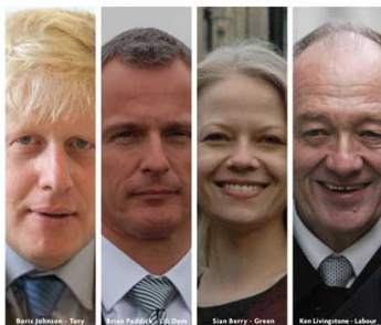
ALL FOUR CANDIDATES FOR LONDON MAYOR OPPOSE A THIRD RUNWAY AT HEATHROW.

They don't agree on much, but they're all against this. Find out why, and what we're doing to stop it. Text OFFICE to 63777.