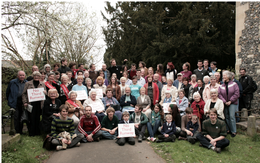
For video of event click Adopt a Resident

Our work revolved around direct action activists getting to know local residents, particularly in the threatened villages in the NoTRAG area. A number of Plane Stupid activists moved into houses in the area and set up direct action training sessions. But they also became part of the community, staging film shows, taking part in local carnivals and regenerating derelict sites (such as the imaginative Grow Heathrow site, cultivated by Transition Heathrow, photo below ). Important friendships were formed. One of the early events where activists and residents got to know each other took place in St Mary's Church Hall, the 11 th century Parish Church in Harmondsworth, where individual residents were 'adopted' by activists. Later in the autumn a Ceilidh – similar to a barn dance – was organised by activists who came down from Scotland. Heathrow residents were being 'adopted' by activists from across the UK. The activists were welcomed into a community which had become worn down by nearly ten years of struggle. Some residents were selling their homes to BAA. There were real fears that the fabric of the community might fall apart. Once again, as after the Climate Camp, activists helped reassure residents they were not on their own. More widely, Heathrow had become such an iconic battle in the fight against climate change that thousands of activists from across the country were ready to descend on the airport if a third runway was not dropped.