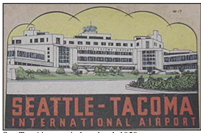
Sea-Tac Airport window decal, 1950s