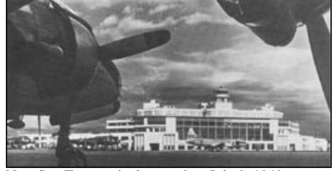
New Sea-Tac terminal opened on July 9, 1949