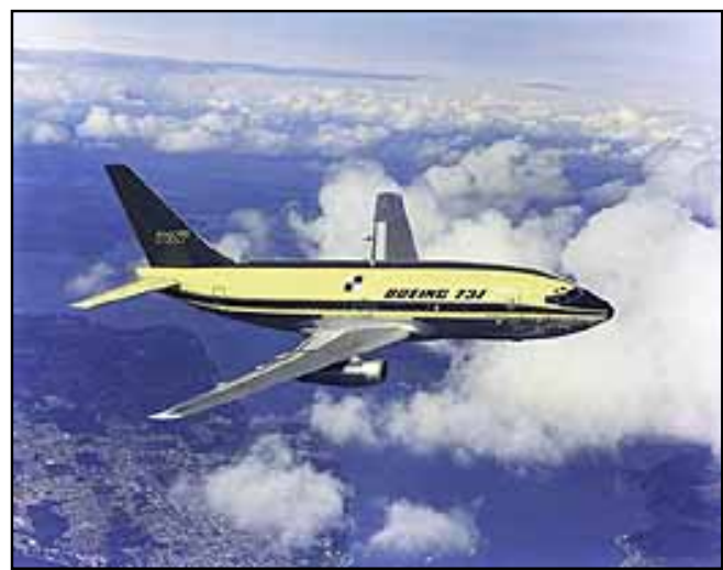
Boeing 737