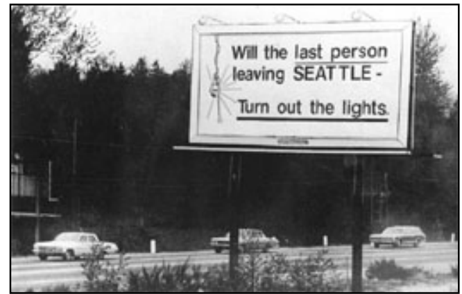
Will the Last Person Leaving Seattle... billboard, 1971