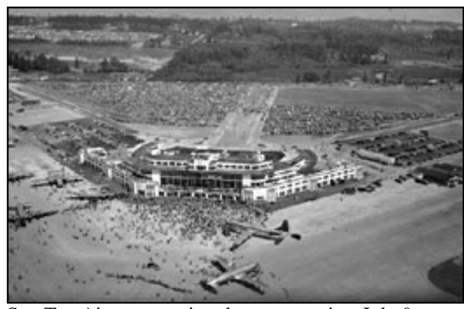
Sea-Tac Airport opening day ceremonies, July 9, 1949 Courtesy MOHAI (Neg. P-I 020340)

The Navy's acquisition of Sand Point in 1926 created a new headache by displacing Boeing and other civilian pilots. William Boeing threatened to move his company, already the city's largest civilian employer, unless the County built a new airport that he could use. Seattle Mayor Bertha K. Landes called development of a public airfield one of the city's "most urgent and important problems," and Port of Seattle Commissioner George B. Lamping opined that port authorities were the best suited public agencies for the task