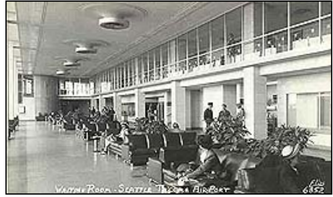
Waiting room, Sea-Tac Airport, 1950s Postcard

In the year of the Dash-80's first flight, the number of