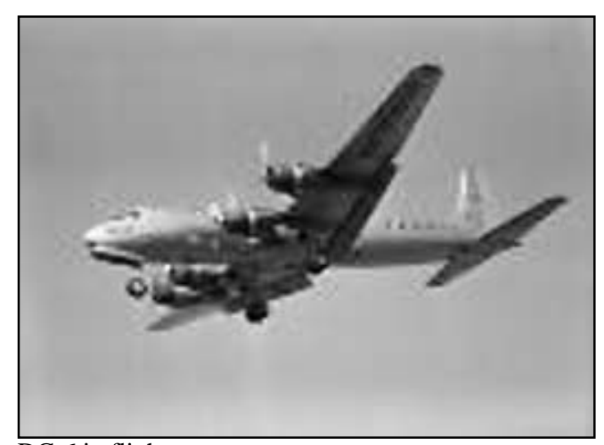
DC-6 in flight