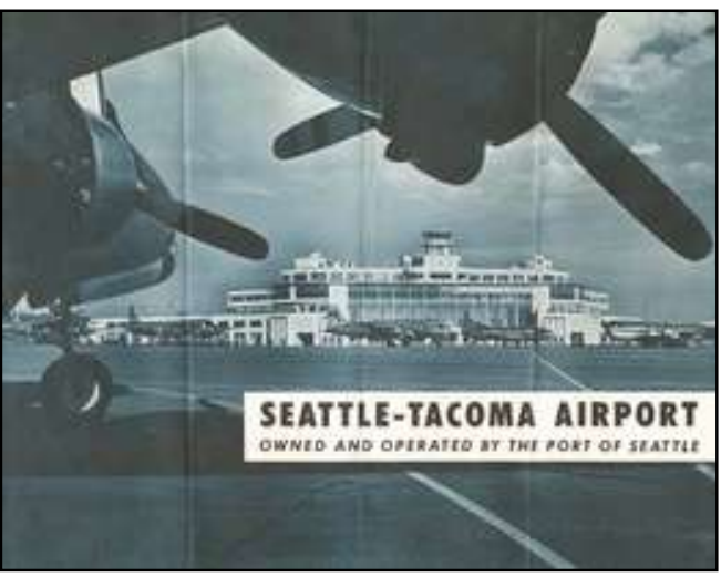
Sea-Tac Airport brochure, 1956

This volume of traffic, and the introduction of faster and larger aircraft such as the four-engine DC-6, quickly strained the capacity of the main north-south runway. The strip was extended to 7,500 feet in 1950 and resurfaced two years later