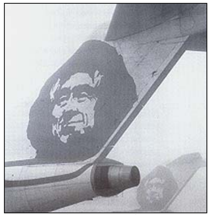
Two Alaska Airlines planes in the fog at Sea-Tac Airport, ca. 1992

Later route adjustments, combined with restrictions on nighttime operations by older, noisier aircraft and the introduction of quieter "Stage 3" jet engines on new aircraft,