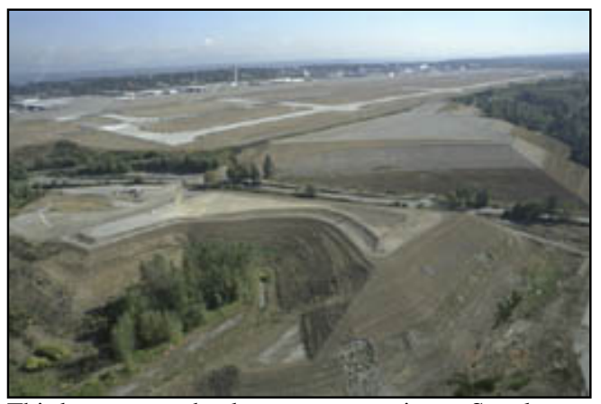
Third runway embankment construction at Seattle-Tacoma International Airport, 2002

After three years of study and dozens of public hearings, the