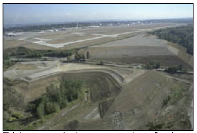
Third runway embankment construction at Seattle-Tacoma International Airport, 2002

On March 7, 1942, three months after the Japanese attack on Pearl Harbor, the Port of Seattle undertook development of Seattle-Tacoma International Airport at the urging of the federal government. A new airport was desperately needed to help relieve pressure on Seattle's Boeing Field and Tacoma's