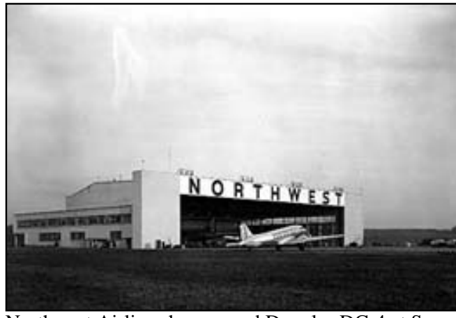
Northwest Airlines hangar and Douglas DC-4 at Sea-Tac Airport, 1948 Courtesy MOHAI (Neg. 83.10.16,871)