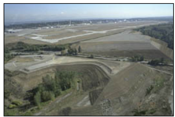
Third runway embankment construction at Seattle-Tacoma International Airport, 2002