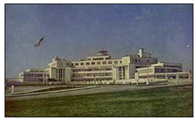
Sea-Tac Airport, 1950s Postcard