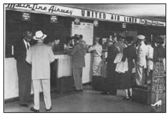
Ticket counter at new Sea-Tac terminal, 1949