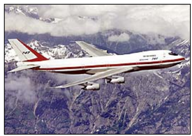
Boeing 747 in flight

This time, the Port vowed not only to pull even with but to leap ahead of the accelerating pace of airline travel. In October 1967, the Port announced a $44 million expansion program, including construction of a second north-south runway set 800 feet west of and parallel to the main runway.