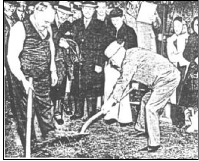
Seattle and Tacoma Port Commissioners broke ground for new airport on January 2, 1943