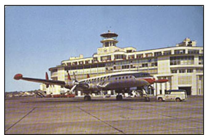
Northwest Airlines Constellation airliner at Sea-Tac Airport, 1950s Postcard