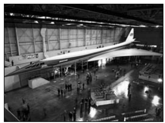
Final Boeing SST mockup, which was scrapped in 1971