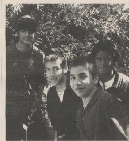
Students from Aviation High School visit an area along Miller Creek where native vegetation has been restored. About 100 sophomores toured Sea-Tac Airport environmental facilities and restoration areas as part of Airports and the Environment studies.

In addition, employees developed and taught a week of curriculum for the sophomore class at Aviation High School designed to introduce students to airport environmental issues and spur interest in environmental careers. The curriculum became the basis for the students' end-of-the year project, and culminated with the students presenting their initiatives before a panel of aviation experts. This was the second year for this program, which covered noise abatement, storm water management, climate change, wetland and creek mitigation, and environmental finance.