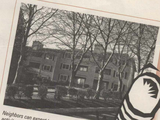
Neighbors can expect to see demolition activity this summer at the Lora Lake Apartments location, near the north end of Sea-Tac Airport's third runway.

To comment or ask questions about demolition activities, call (206) 439-7777.