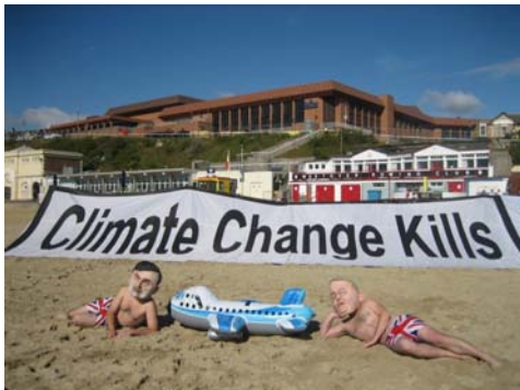
Climate change was the big concern for many of the national organisations in AirportWatch.

For many of the national environmental organisations within AirportWatch, climate change was the big concern. It was the reason they started campaigning on aviation. They saw fighting airport expansion as part of their wider campaign against the threat of climate change. Organisations such as Greenpeace and Friends of the Earth put a huge amount of