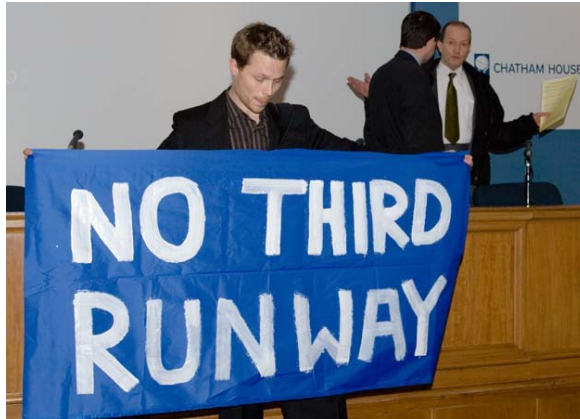
West London residents join Plane Stupid in disrupting aviation conference in Central London.

Plane Stupid became active in the Heathrow campaign. Activists, working alongside Seeds for Change, the organisation which assists community groups, helped train West London residents in direct action. These were local people, including a fair number of HACAN members, who had expressed an interest in taking direct action. The training led to a number of actions, including residents invading a major aviation conference in Central London where the Douglas Alexander, Secretary of State for Transport, was speaking. The purpose of these direct action events was two-fold. It was to put a warning shot across the bows of government that residents were willing to go further than ever before to stop expansion. But it also provided an opportunity to identify and train up people who might be prepared to take part in a prolonged campaign of direct action should the expansion proposals not be dropped.