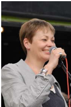
Green Party Leader Caroline Lucas, consistently helpful, spoke at a number of our meetings and rallies.

The coalition organised over 40 public meetings attended by an estimated 20,000 people in total