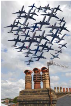
A feature of the last 15 years has been the way in which aircraft noise has become a problem many miles from Heathrow.

I began to chair HACAN, the Heathrow residents' organisation, in 2000. I had first become involved in aviation campaigning two or three years earlier. What prompted me was the sudden problem of aircraft noise over my house. I had lived and worked in South London for twenty years. Aircraft noise had never been a problem. I had always seen it as something of concern in West London and Windsor. That all changed in the second half of the 1990s. Aircraft started roaring overhead, sometimes at a rate of one every 90 seconds. I was not alone. Disparate individuals came together. We held public meetings, one attended by the local MP Kate Hoey, who has been a firm supporter of the campaign ever since. We formed an organisation called ClearSkies. The Department for Transport, with an evasiveness we were to come to know so well, said that nothing had changed and that, anyway, we were far too far from Heathrow for noise to be a problem. (We subsequently learnt significant changes had been made). More than a dozen years later, aircraft noise is still a problem in South London. We may have stopped a third runway but the daily turmoil for people who never expected to be under a flight path goes on.