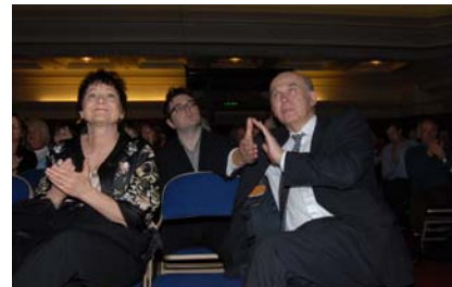
Sarah Ludford and Vincent Cable