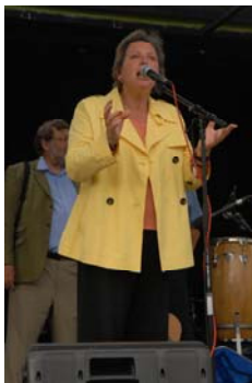
Susan Kramer MP was an important and committed figure in the campaign. She headed up the Lib Dem opposition.

The decision was postponed until January as the Cabinet was split