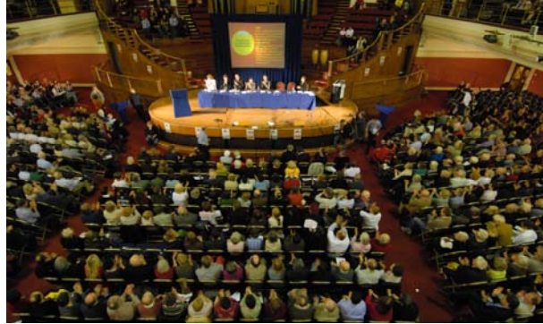
3,000 people poured into Central London for the biggest indoor rally in our history.

We had one big challenge left during the consultation period. We had booked the largest hall in Central Halls, Westminster, a well-known meeting venue in Central London, for an end-of-consultation rally. We took an enormous risk. The hall held 2,500 people. We knew we had to fill it to make an impact. 1,000 people, normally regarded as a huge crowd for a meeting, would have looked like failure. As we had gone round our public meetings, we urged people to come and demonstrate their opposition to expansion in the famous venue, just across the road from Parliament and a stone's throw from the Department for Transport headquarters. That Monday evening, two and a half thousand people poured into the hall, with another five hundred in an overspill hall. As the band struck up, I looked across to NoTRAG's Geraldine Nicholson, who had done so much to help organise it, and we both knew we had done it. The rally, chaired by our President Jenny Tonge, a champion of the cause for many long years, was addressed by local and national campaigners, environmental experts and a vast array of politicians including Nick Clegg, the leader of the Liberal Democrats. Although the rally was free, when we asked for donations, we raised a total of nearly £10,000, which paid for the cost of hiring the hall. An inspiring evening.