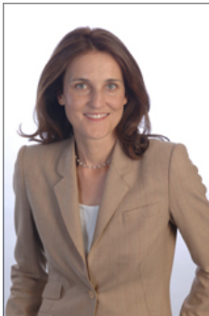
New Aviation Minister Theresa Villiers is ushering in a new approach at the DfT