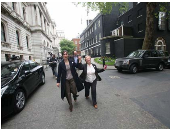
And skipping with sheer joy down Britain's most famous street. We've done it!