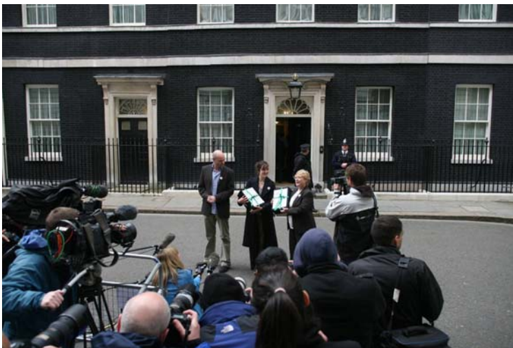
Facing the nation's media