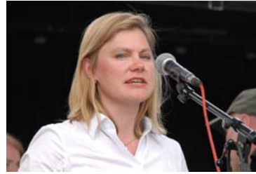
The tenacious Justine Greening, the Conservative MP for Putney, played an important role in the campaign from the early days.

The Liberal Democrats and, not surprisingly, the Green Party had come out firmly against expansion at Heathrow. But, perhaps most interestingly of all, it was becoming clear that there could be some real movement in Conservative Party thinking. David Cameron, the new conservative leader had set up a Quality of Life Commission to look at a range of matters. The members of the Commission were not just drawn from the Conservative Party. They included a number of campaigners from AirportWatch as well as leading lights from the aviation industry. The transport section was chaired by the former transport minister Stephen Norris whom I had known in the 1990s and liked. He had done much to push sustainable transport policies within the Conservative Party. At the Quality of Life meetings it became clear that he saw the sort of airport expansion the Government was envisaging as deeply unsustainable, particularly in the light of its growing impact on climate change. He was opposed to a new runway at Heathrow. The final report of the Quality of Life Commission, though not taken on board as party policy, revealed that new thinking on aviation might well be emerging within the Conservative Party.