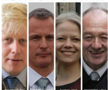
ALL FOUR CANDIDATES FOR LONDON MAYOR OPPOSE A THIRD RUNWAY AT HEATHROW. They don't agree on much, but they're all against this. Find out why, and what we're doing to stop it. See CAPSULE on 43777. enoughenough.org airportwatch GREENPEACE

In the 2008 Mayoral Elections, we persuaded the candidates from all four main parties to oppose expansion at Heathrow – Conservatives, Labour, Liberal Democrats and Greens. Generous funding from Enough's Enough and Greenpeace enabled us to take out a full-page advert in the London Evening Standard highlighting the opposition of the candidates. This captured the headlines big-time. This level of publicity would not have been possible if we had not been part of a wider coalition.