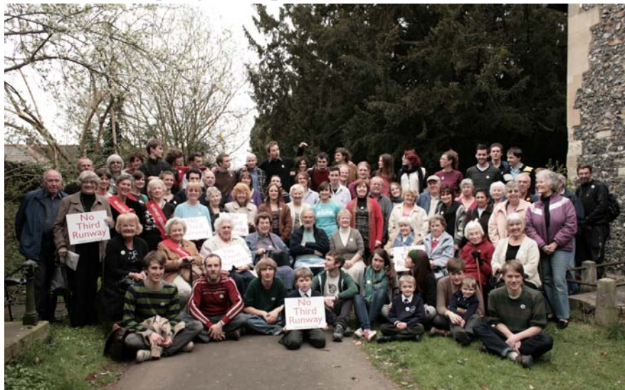
For video of event click Adopt a Resident

Our work revolved around direct action activists getting to know local residents, particularly in the threatened villages in the NoTRAG area. A number of Plane Stupid activists moved into houses in the area and set up direct action training sessions. But they also became part of the community, staging film shows, taking part in local carnivals and regenerating derelict sites (such as the imaginative Grow Heathrow site, cultivated by Transition Heathrow, photo below ). Important friendships were formed. One of the early events where activists and residents got to know each other took place in St Mary's Church Hall, the 11 th century Parish Church in Harmondsworth, where individual residents were 'adopted' by activists. Later in the autumn a Ceilidh – similar to a barn dance – was organised by activists who came down from Scotland. Heathrow residents were being 'adopted' by activists from across the UK. The activists were welcomed into a community which had become worn down by nearly ten years of struggle. Some residents were selling their homes to BAA. There were real fears that the fabric of the community might fall apart. Once again, as after the Climate Camp, activists helped reassure residents they were not on their own. More widely, Heathrow had become such an iconic battle in the fight against climate change that thousands of activists from across the country were ready to descend on the airport if a third runway was not dropped.