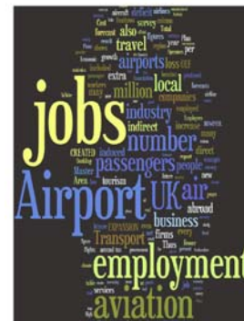
Some reports from AirportWatch have been translated into both French and Dutch.

We were making some headway. We had a memorable, accurate figure; one that challenged the prevailing thinking of the time. We