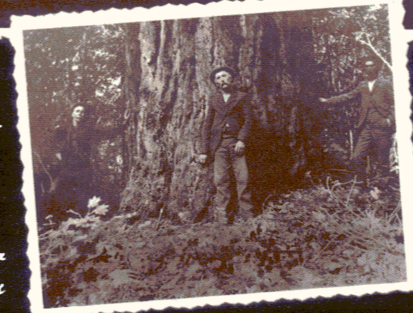
Early Area Loggers