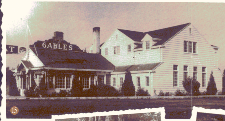
Seven Gables Restaurant