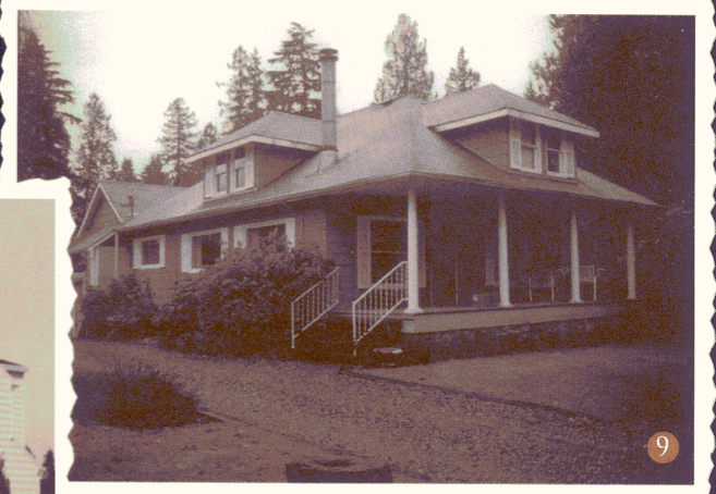
Albert Paul House