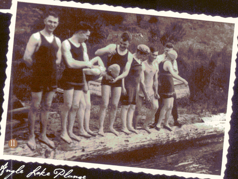
Angle Lake Plunge

Captions Clockwise from top left: The Riverton Heights Grammar School, 1909; the Malmberg Grocery and Gas Station; The Albert Paul House; visitors enjoying the Angle Lake Plunge; Old growth forest that was cleared by early loggers (date unknown); and The Seven Gables Restaurant.