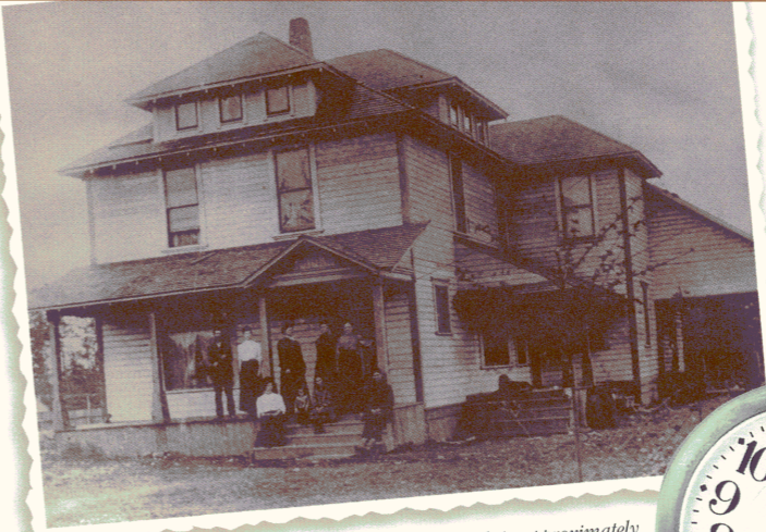
The George Wilcox Home and Family – Built in approximately 1900 this house was located near 16th South which is now the site of the North Satellite of the SeaTac International Airport. Wilcox owned the first Blacksmith shop in the area.

This brochure highlights several significant historical sites in the City of SeaTac. These sites contribute to the historical understanding and identity of this unique area.