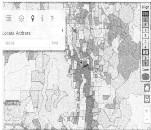
Highest poverty and health disparities connected to Sea-Tac Airport

Highest poverty and health disparities in the region mirror the areas with the highest noise impact and follow the flight path. Blue teardrop is Sea-Tac Airport