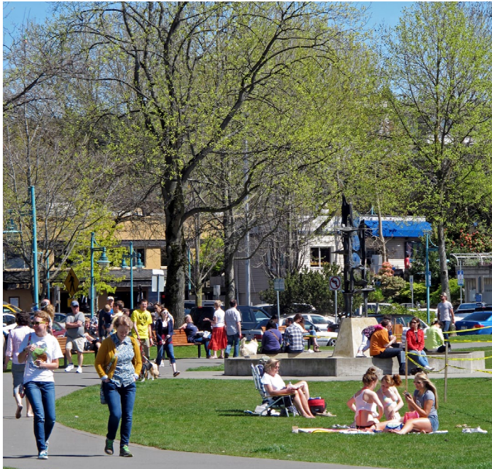
Marina Park, Kirkland

The Prosperity Partnership released an online, self-paced educational version of the Performance First program, developed in