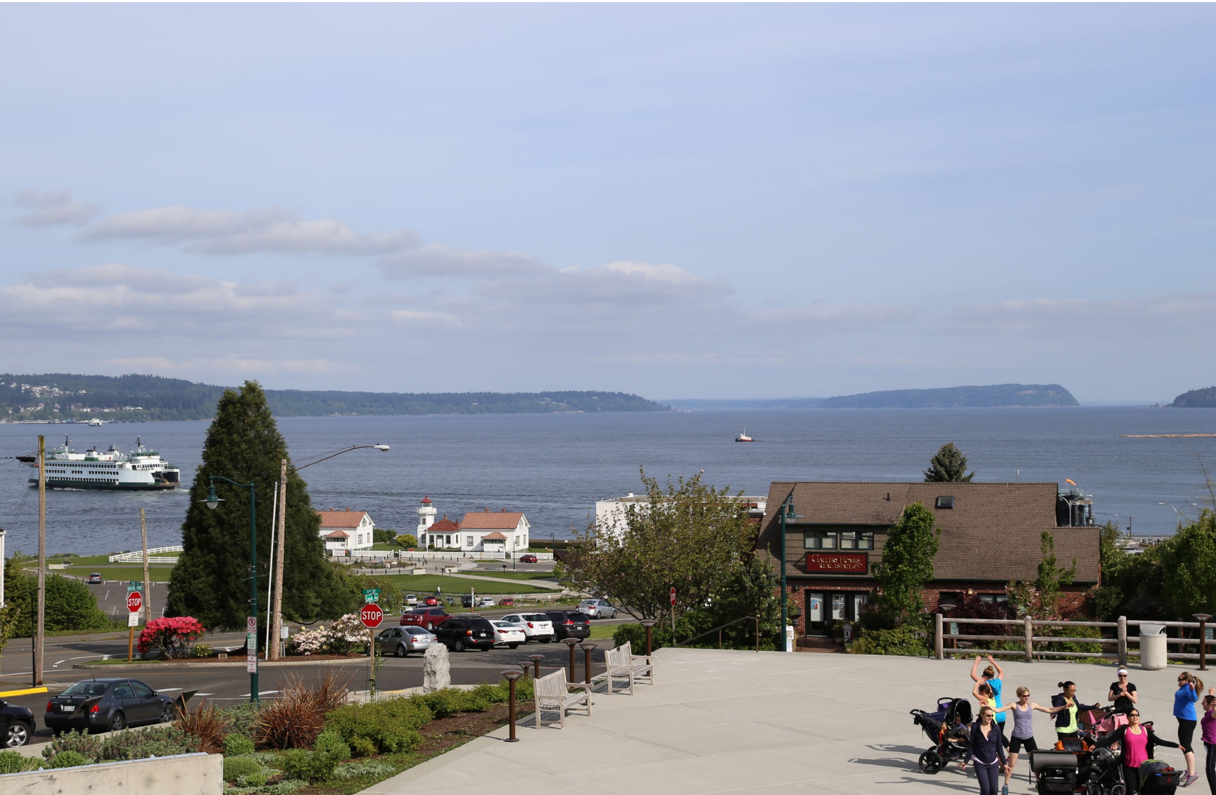
Rosehill Community Center, Mukilteo