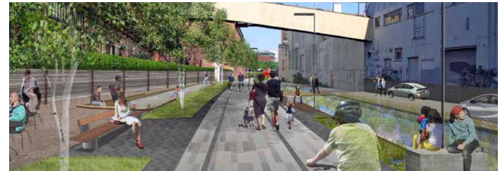
TACOMA'S PRAIRIE LINE TRAIL: Tacoma's Prairie Line Trail received $1.9 million to help build a trail connecting the UW Tacoma Campus to the Thea Foss Waterway.

Special needs transportation funding from PSRC and the Washington State Department of Transportation provided $6.5 million to 17 projects that help meet the travel needs of people who are disabled, unable to drive or are living with low income.