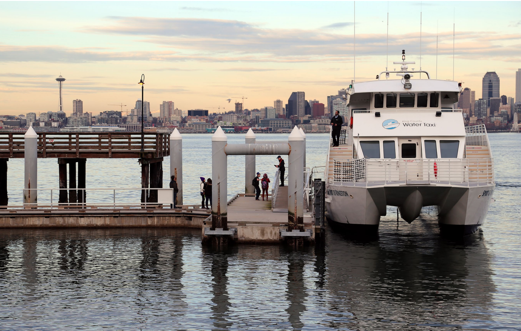
King County Water Taxi, West Seattle