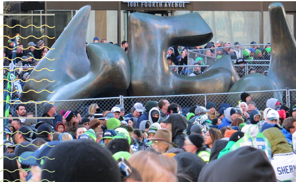
Seattle Seahawks Superbowl XLVIII Victory Parade