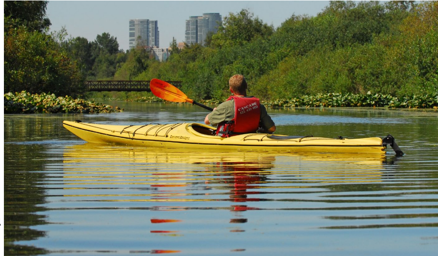
Mercer Slough, Bellevue

By 2016, major regional projects like light rail to the University District, a new floating bridge across Lake Washington, and the SR 99 tunnel in downtown Seattle are expected to be well underway or complete. These projects will be important steps forward in realizing the region's transportation vision. Over the next few years, PSRC will be laying the foundation for planning out to the year 2050, collecting data and collaborating with stakeholders around the region in anticipation of the next major update of the transportation plan in 2018.