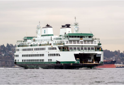
MV Tokitae, Washington State Ferries

The Puget Sound Regional Council, also known as PSRC, is regional planning agency with specific responsibilities under federal and state law for transportation planning, economic development and growth management.