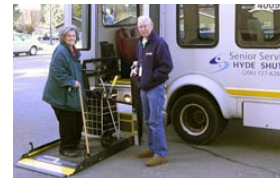
SUSTAIN HYDE SHUTTLES: Hyde Shuttles in King County received $1.8 million to provide transportation service to seniors, and people with disabilities of all ages.