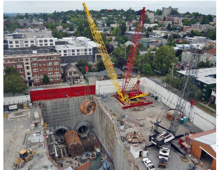
University Link Extension, UW Station

From 2006 to 2013 , the region has invested over $10 billion in transportation — some $145 million in bicycle and pedestrian projects, $5.2 billion in roadway-related projects, and $4.7 billion in transit and ferry projects, via federal, state and local funding sources.