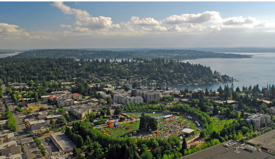
Bellevue Downtown Park

With guidance from the Regional Food Policy Council, PSRC developed a set of Food Policy Blueprints for local governments. The blueprints provide recommendations and examples of how local communities can take steps to support the food economy and improve access to locally produced food.