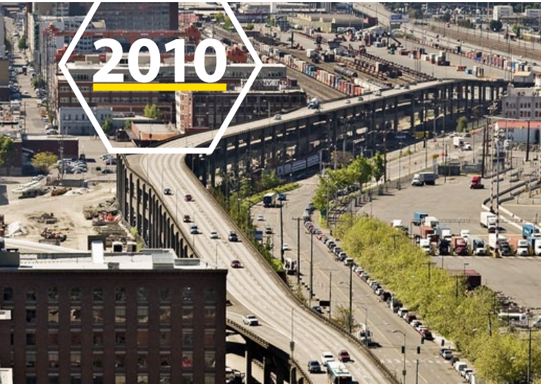
Alaska Way Viaduct SR99