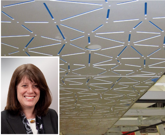
CLAUDIA BALDUCCI — CHAIR — TRANSPORTATION POLICY BOARD CITY OF BELLEVUE — MAYOR

One of PSRC's most important roles is to develop a regional transportation plan. The plan, Transportation 2040, is the region's blueprint to guide investments and set transportation priorities for the long term. PSRC updates the plan every four years to reflect changing demographics, new technology, economic forecasts and other factors affecting the region's transportation needs.