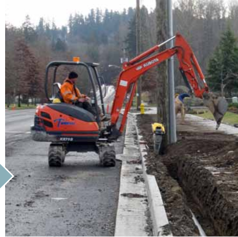
Puyallup's Shaw Road Extension: This $24.6 million project provides an important connection from South Hill to SR 410. A priority FAST Corridor project, the bridge over the railroad crossing provides better access for the Port of Tacoma to SR 167.