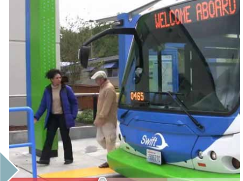
Community Transit's new SWIFT bus rapid transit between Everett and Shoreline began in November. Nearly 17 miles long, SWIFT is the longest bus rapid transit line in the nation and the first in the region. PSRC provided $7.4 million in federal funding to the project.